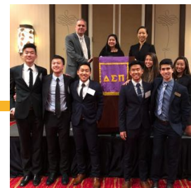
BROTHERS AT LEAD 2/2/18