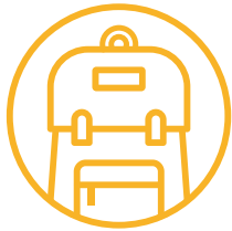
START OF SCHOOL 9/25/17