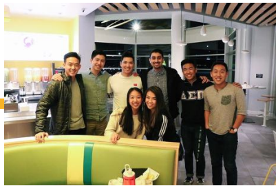
OC ALUMNI MEET UP @ LEMONADE 2/11/18