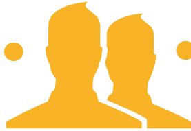
DAVE & BUSTER'S ALUMNI EVENT 1/24/18